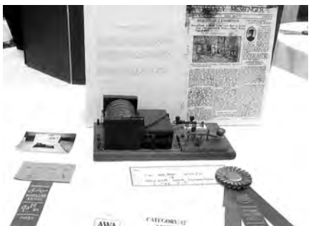
A homebrew spark transmitter display brought Tim Walker a first in “Spark Transmitters and Artifacts” (returning).